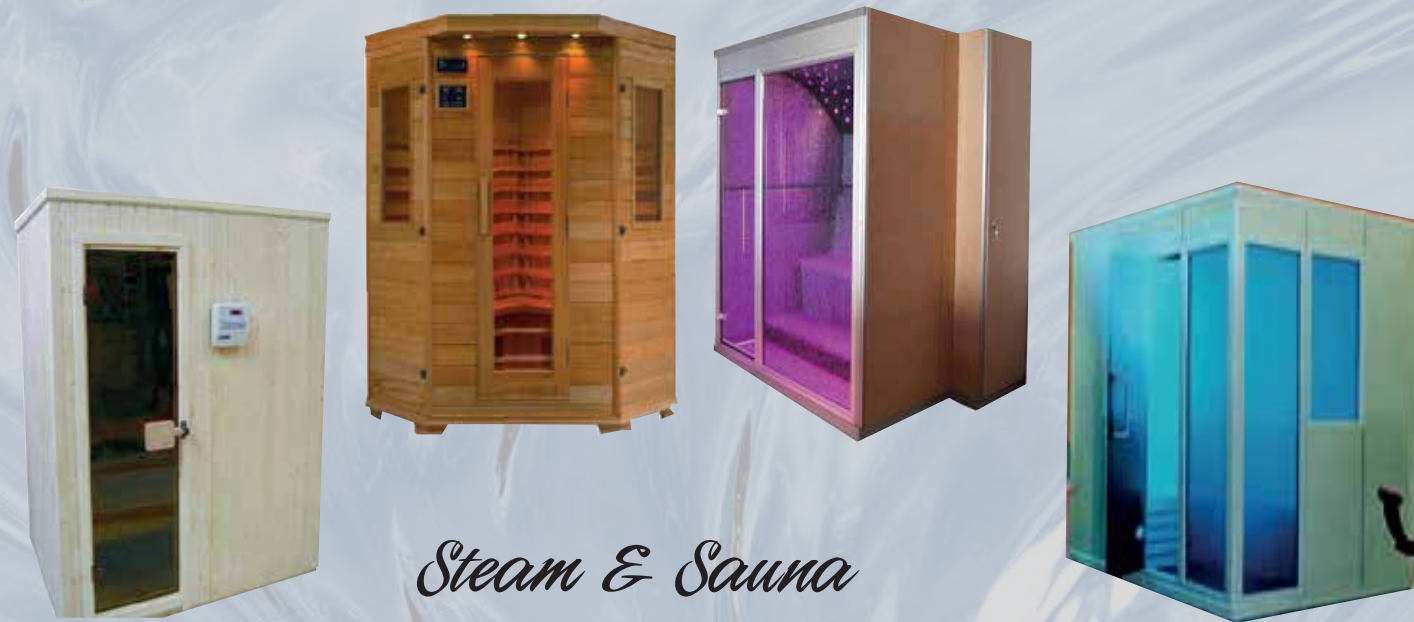
Steam & Sauna